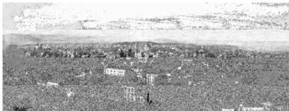
Bird's eye view of Binghamton, circa 1920

Members of the BCHS receive 10% off any BCHS publication. Members also pay half the cost of research ($5.00/hour instead of $10/hour). Your membership dollars helps us to continue our valuable work.